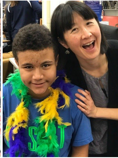
Fabulous Newbery Awards

Party, music, dancing, mocktails (mock tales?), and great snacks