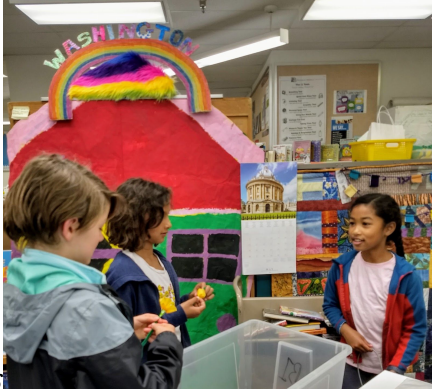
Zara checked in books