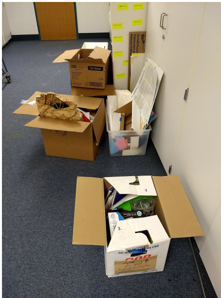
Photo below: May 27th we sorted six boxes from the top of the cabinets. Jackpot! I found two boxes full of boxes of pastels.

Concerns: A few years ago I had a student who reportedly stole library books from other students in the classroom. I made six book records (mostly Dav Pilkey titles) "lost" in one second grade classroom after the students said the books disappeared. I may hide the new Pilkey books that I've ordered-- keeping temptation out of his way.